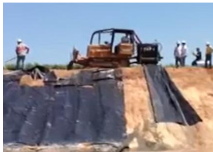
Proprietary rolling equipment