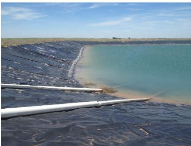
Large fracking pond